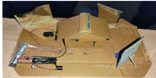
Figure 11. Hardware Model and Design